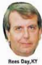
Rees Day, KY