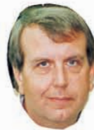
Rees Day, KY